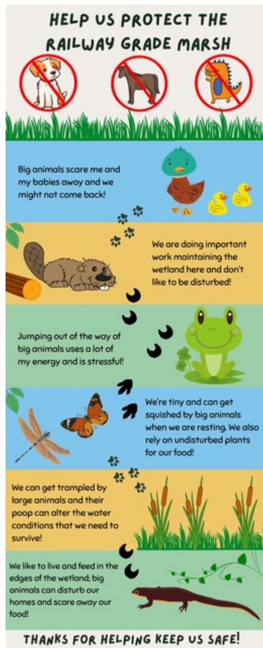
New sign to be installed at RGM kiosks

DCA representatives were privileged to talk to young men and women who may become the environmental leaders of tomorrow and to whom our precious planet and its wild spaces are entrusted.