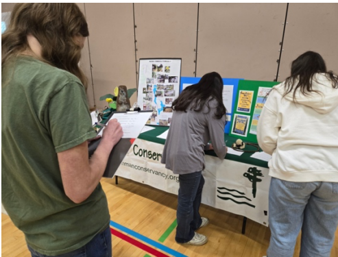
Students at the DCA Booth at Isfeld

The students were engaged and thoughtful, having lots of ideas on how to keep wildlife safe in conservation areas including: