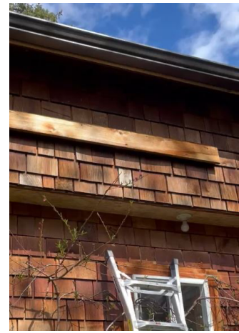
New temporary bat home