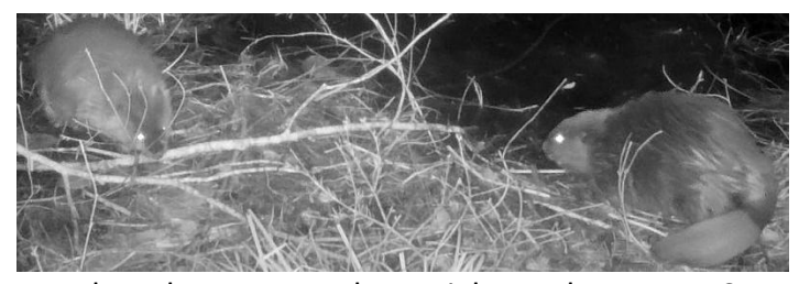
Two busy beavers caught at night on the Beaver Cam