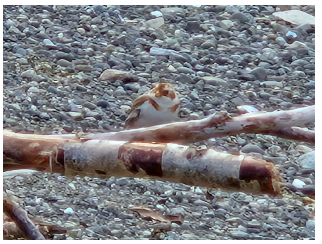
Snow Bunting seen on Denman Christmas Bird Count

The next Birdathon is on! Starting at 4PM on May 23 until 4PM on the 24<sup>th</sup>, entrants will be trying to identify as many avian species as possible to raise money for the DCA. Each entrant will get sponsors to donate a certain $ amount for each species recorded in the 24 hour period. A gathering will follow on the 25<sup>th</sup>, where prizes will be awarded for youngest (and oldest) birder, most birds seen fossil fuel free and other fun categories! Get your hiking shoes on, put your bird book in your day pack and come on out!